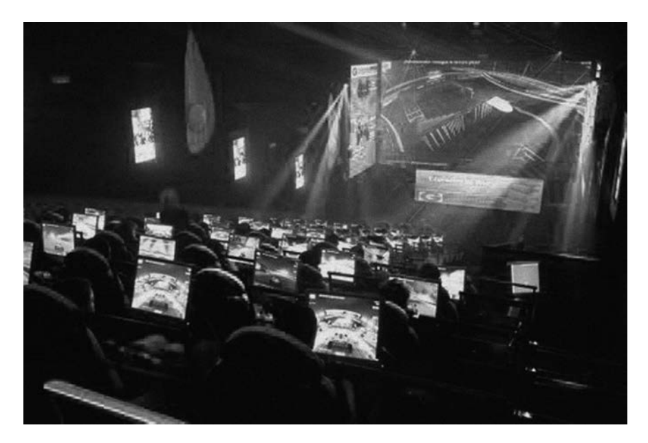
Fig. 4: The interactive theater of the future for multitasking spectators, as envisaged by a digital projector manufacturer.