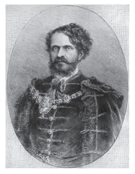
Figure 3. Count Gyula Andrássy

By 1867, Andrássy was, more than ever, obsessed with the danger to Hungary from Pan-