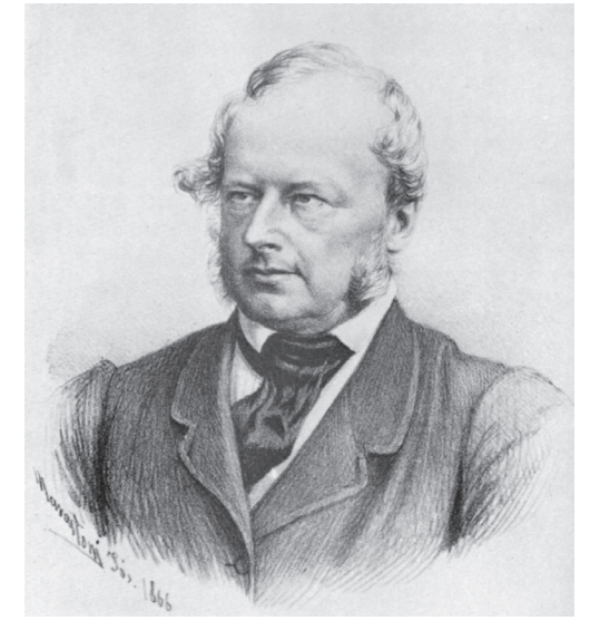
Figure 2. Count Friedrich Ferdinand von Beust

It was essential, therefore, to forestall an explosion by improving the lot of the Balkan Christian