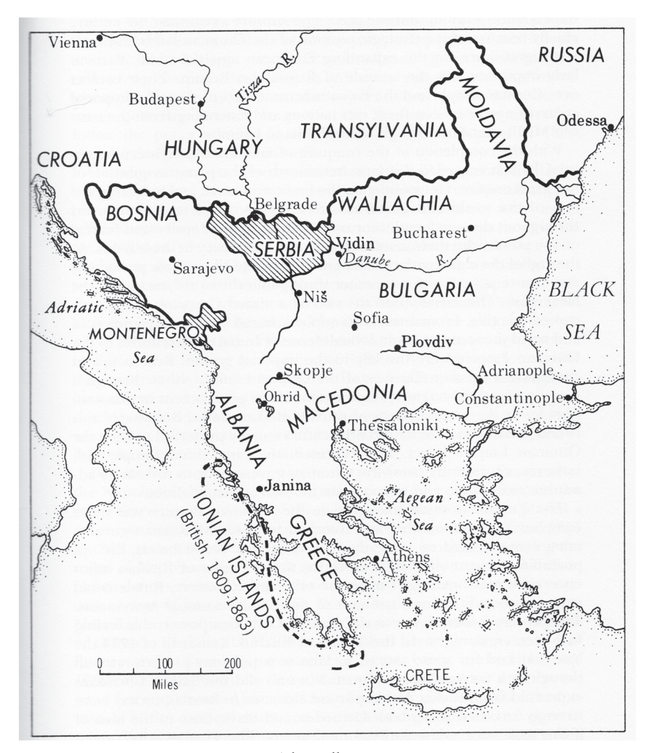
Map 3. The Balkans in 1815

war of liberation on behalf of the Balkan Christians; and Zastava was among the bitterest of these critics. There was considerable injustice in this: Michael was only too aware that Serbia's real military potential was far less than its strength on paper would suggest. None of this, however, was known outside of Serbian government circles, and the problem was compounded by the events of 1867, when the Prince, at the very time the Hungarian government was abandoning its Serb minority, showed every sign of having done a deal with Budapest. The Vojvodina became, more than ever, the center of agitation against the Serbian government.<sup>70</sup>