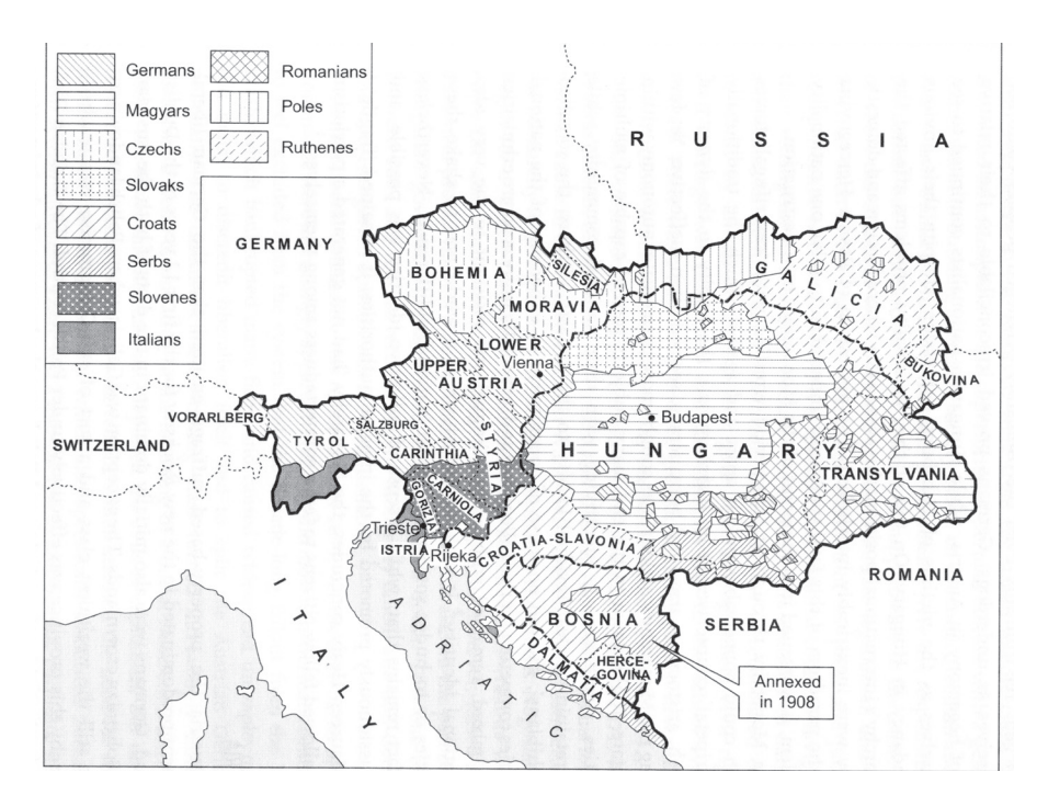
Map 2. Nationalities of the Habsburg Monarchy

The Austrian Statute 146 of 21 December 1867, by contrast, made no mention of the common foreign minister's obligation to consult with the ministries of the two halves of the Monarchy. Article 1(a) stated to be "common"