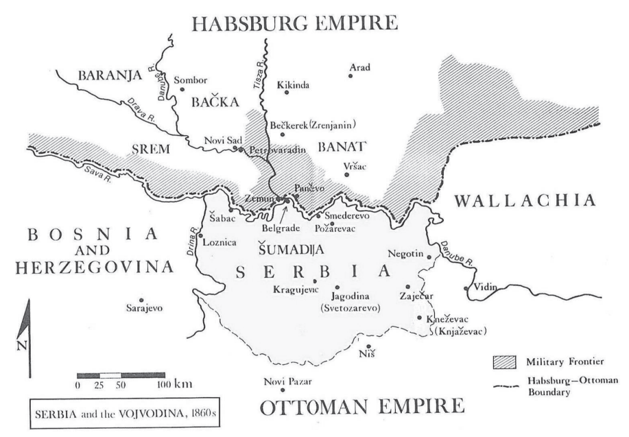
Map 4. Serbia and the Vojvodina, 1860s

fitted tidily into the Habsburg Monarchy a score of times. Its population still numbered only a million, the vast majority of whom made their living off the land in a country with virtually no modern infrastructure. 71 Its official military strength was a sham, rather like the frog that inflates itself to twice its size to impress its enemies. Though autonomous, its Prince was still a vassal of the Sultan.