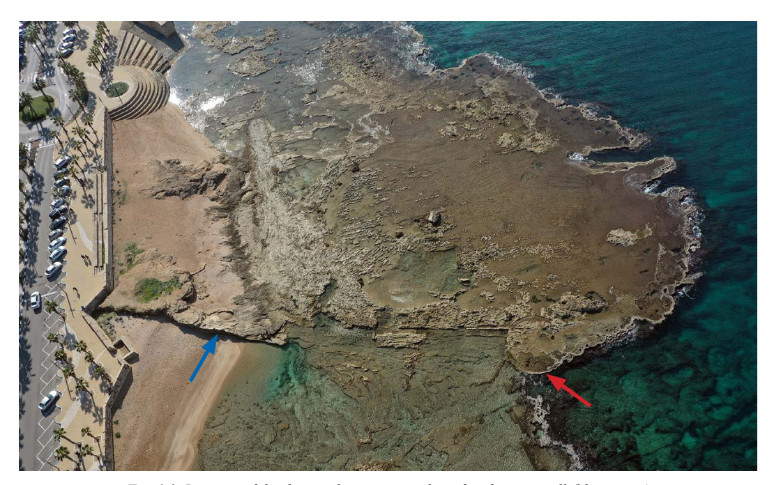
Fig. 1.3. Remains of the thirteenth-century northern fortification wall (blue arrow) exposed next to the rock-cut foundation trench of a round tower (red arrow) located on the edge of a coastal reef, looking south.

A market street of the Montmusard Quarter, lined with shops on both sides, was revealed through examination of aerial photographs taken at the beginning of the twentieth century (Fig. 1.2:23; Boas 1997). Just to the south, the foundations of two large buildings and three massive pillars belonging to another large building were uncovered (Fig. 1.2:24; Abu-'Uqsa and Abu Ḥamid 2012). About 50 m farther south, wall remains and two wells were exposed, dated by ceramic finds to the Crusader period (Fig. 1.2:25; Vitto 1980, 2005). Slightly inland, two occupation layers of the Crusader period were revealed with mid-twelfth-century floors of domestic buildings and nearby, a massive thirteenth-century