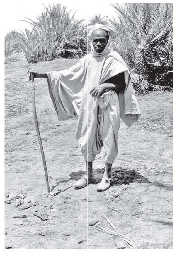
Figure 0.2. Fazzanese farmer in one of CMD's ethnographic photographs (CMD 1959).

The Garamantes have emerged in the last decade much more prominently into the scholarly spotlight as a result of the publication of the Archaeology of Fazzān (hereafter AF) volumes (Mattingly 2003; 2007). The reports in this volume will make it much more apparent how big a debt is owed to CMD for opening up study of this hugely significant African people.