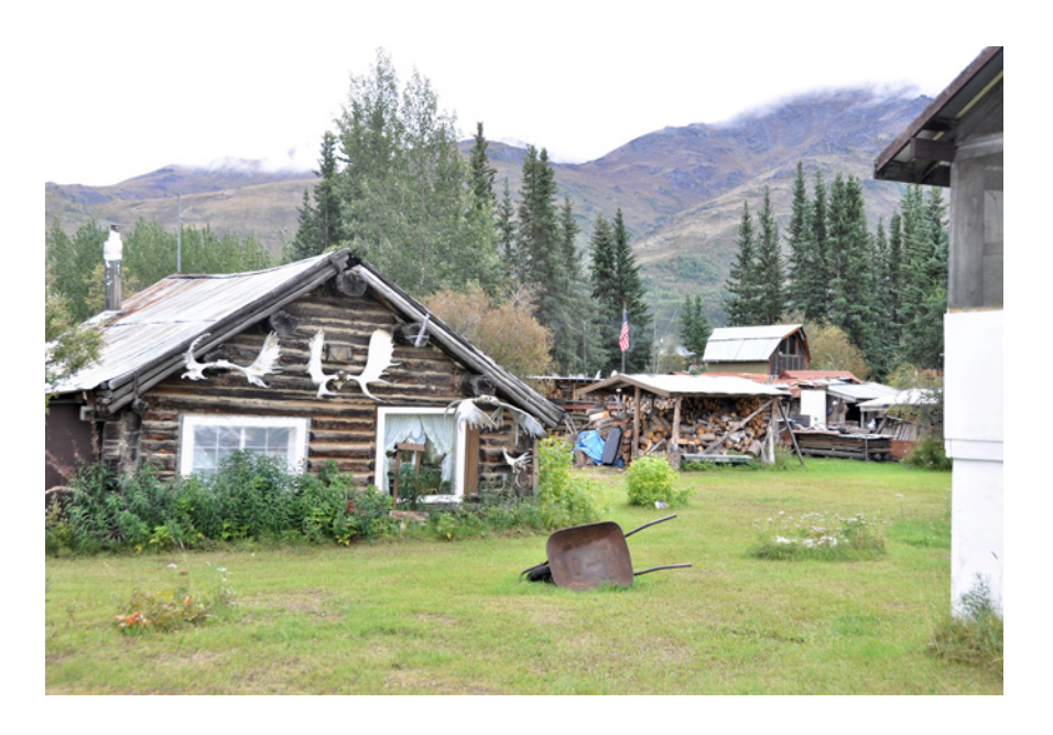
Some of the original goldminers' cabins can be seen around Wiseman.

Many of the huts are decorated with moose antlers. Wiseman's remote location produces some interesting results and cultivates inventiveness. There are tall, homemade antennas and satellite dishes, small trucks with eccentric modifications, walls and roofs improved with corrugated iron and aluminium from long-forgotten construction sites. Hardly anything is thrown away in Wiseman. At the edge of the village, an ancient caravan covered in yellow lichen is hidden away. Perhaps a tourist left it behind? Or was it home to a pipeline worker, a prospector or a thrill-seeker? One time we stumble across a pile of tens of thousands of old aluminium cans: Miller beer and Budweiser, Pepsi and Sprite. The locals ironically refer to this local artwork as 'The Totem Pole of the White Man'. A little further up, overlooking the village, there is a completely overgrown cemetery. Over forty people and some dogs are buried here. Most of the grave markings are made of wood, weather-beaten and no longer decipherable. One of the few gold prospectors here with a gravestone – Harry Ross (1939–1975) is decorated with an American flag and