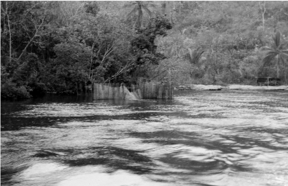
Figure 1.9 Fishtrap made of wood and brush in sungai