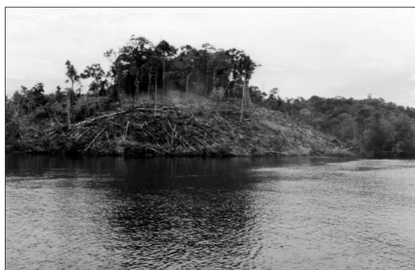
Figure 1.6 Slashing and burning for swidden agriculture on Sungai Papakulah near Benjina