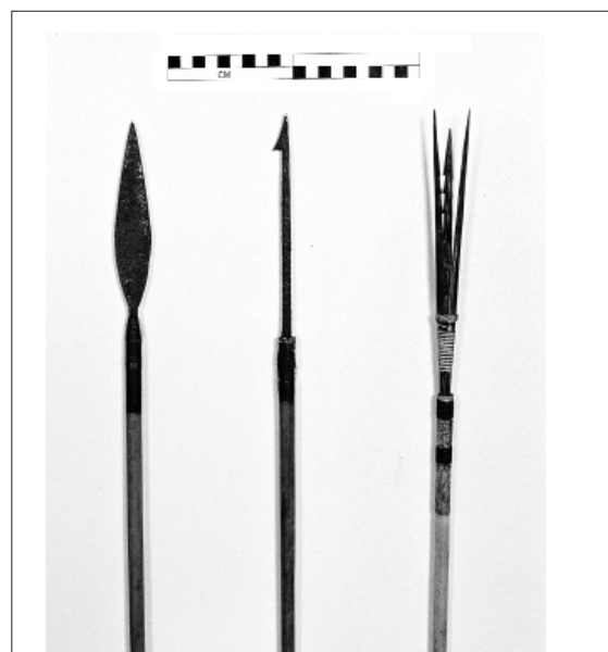
Figure 1.8 Three arrows collected by authors from a hunter at the village of Papakulah Besar