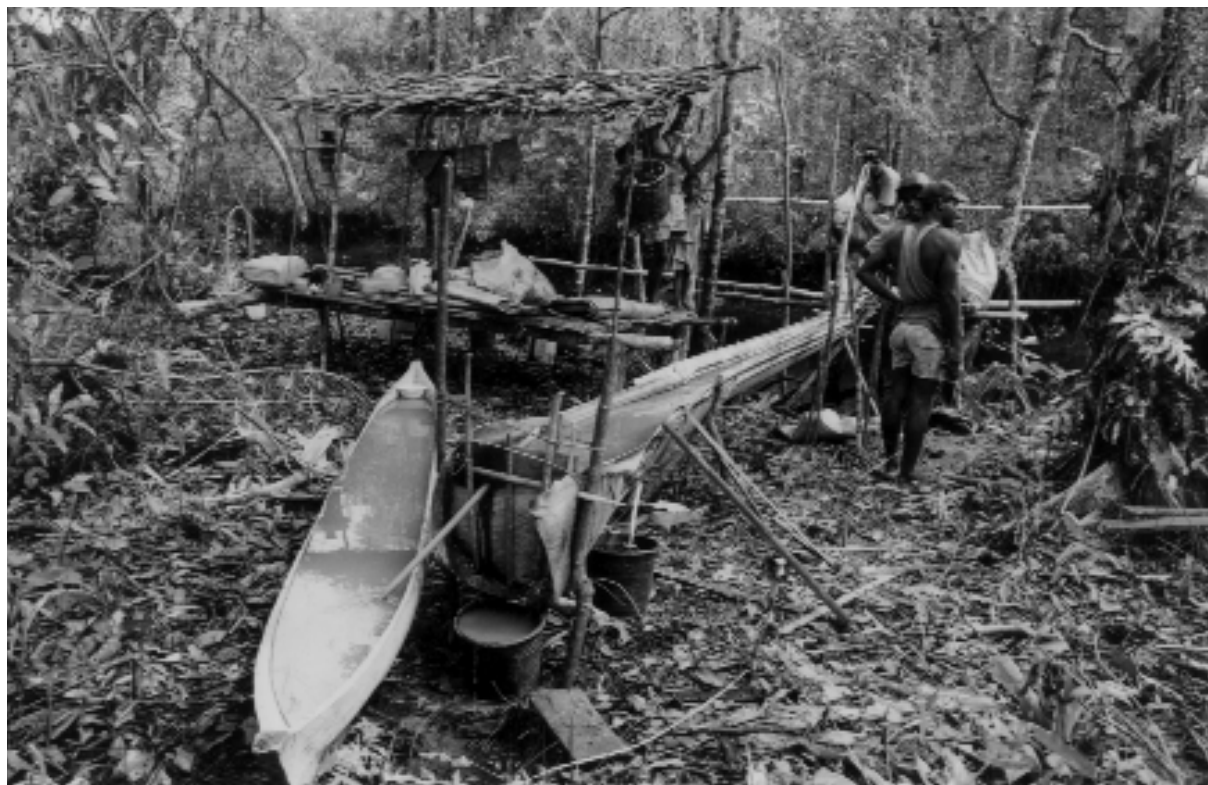
Figure 1.5 Sago processing