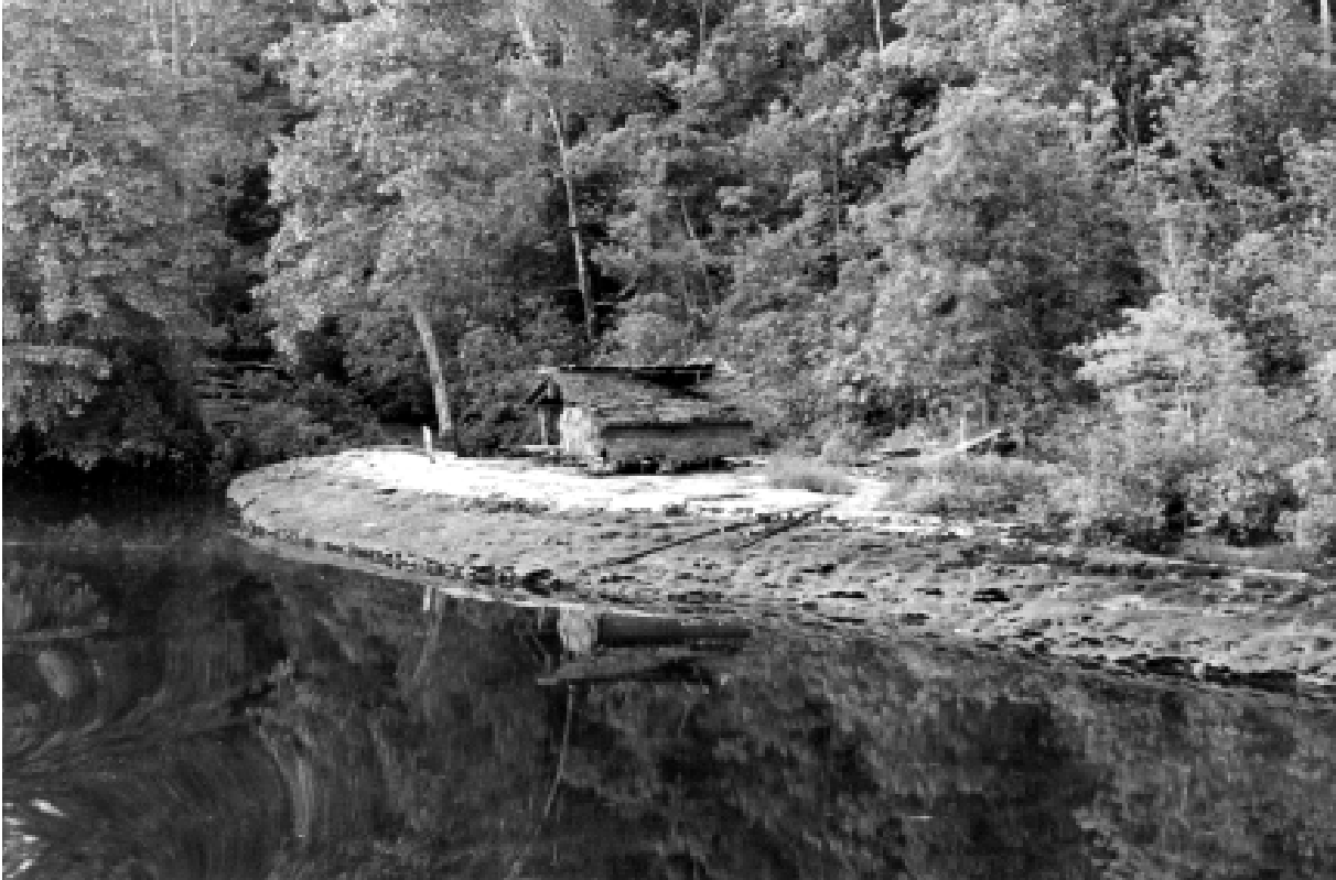
Figure 1.2 Small hut on sungai , probably very similar to the one in which Wallace would have stayed

Wallace headed back to Dobo and watched the traders packing up before they headed back to Sulawesi and points west, with the shifting wind of that season. He had time to wonder at the price of European goods in this out of the way port: