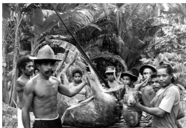
Figure 1.7 Hunters and local villagers with catch of Rusa deer