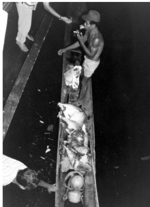
Figure 1.4 A mobile hunter sells or trades his catch of deer and cassowary from his canoe on the sungai