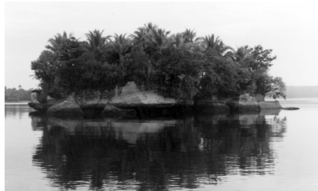
Figure 1.3 Island in sungai showing bedding in uplifted marine sedimentary rock

The earliest direct historical reference to Aru is in the Suma Oriental of Tomo Pires dating from 1512–15, from information collected at Melaka (Courtesao 1944:209). Subsequently, the Portuguese must have at least circumnavigated the archipelago by about 1530, as it appears on maps from that time (see Chapter 5, this volume, for information on historical sources for Aru). Apart from the construction of occasional forts such as that at Wokam from the mid-17th century onwards, there was little attempt by the Dutch to establish a significant presence on Aru until well into the 19th century (see Chapter 4). Islam may have been introduced in the late 15th century, and Christianity came in with the Dutch in the 17th and 18th centuries. While much of the population was not converted to Christianity until the 20th century, it is untrue that Christian missionaries did not have any success until the 1920s as claimed by Dolcemascolo (1996:82).