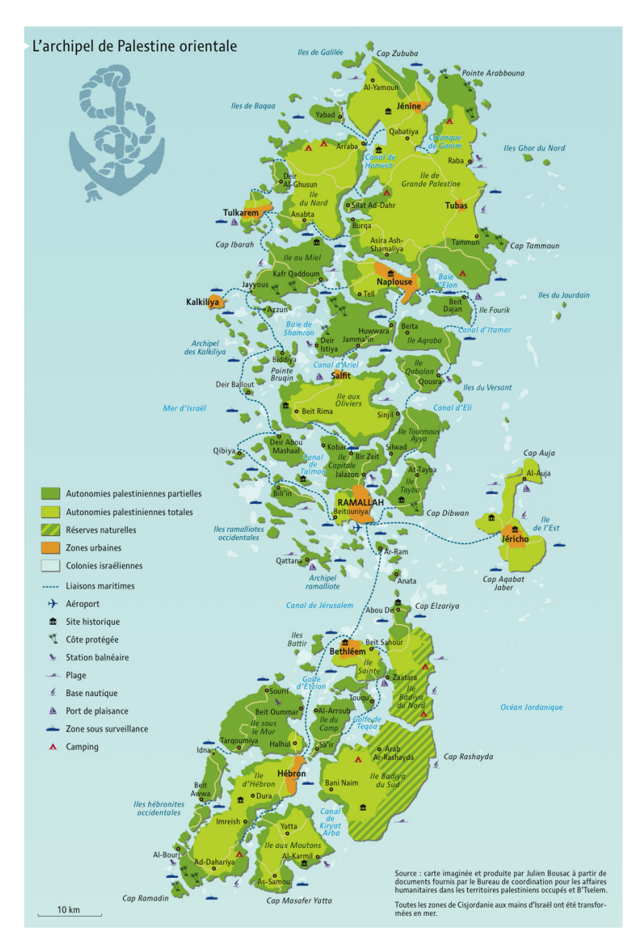
FIGURE 1. L'archipel de Palestine orientale, by Julien Bousac.