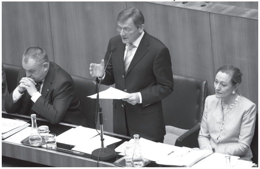
Chancellor Schüssel explains Austria's position on the U.S. invasion of Iraq to parliament.

Russia, and ignore Germany."88 The Iraq War unleashed the worst crisis in US – EU relations since the existence of the European Communities.89