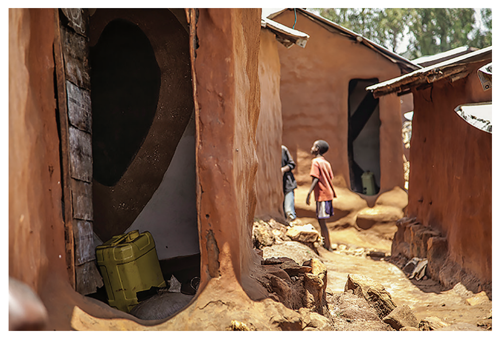
I.1 Nyabiheke refugee camp, Gatsibo, Western Province, Rwanda, September 2015.

I started to work designing and evaluating early childhood development (ECD) facilities - inside and outside the refugee camps – in Rwanda in 2011 when I also began teaching at the country's first school of architecture. Like many professionals involved in humanitarian assistance. I want to understand the impact of my work and ensure that I provide what the users of my