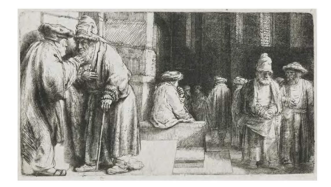
2 Rembrandt, Pharisees in the Temple , formerly known as Jews in the Synagogue , 1648 Etching, 7.2 × 12.9 cm