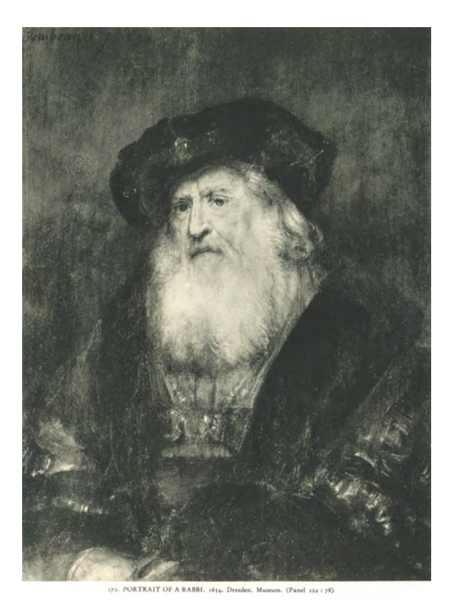
Rembrandt workshop, Bearded Man with Black Beret, 1654 Oil on panel, 102 × 78 cm

Dresden, Gemäldegalerie (1567; from illustration in Bredius 1969, no. 272, where it is captioned "Portrait of a Rabbi.")