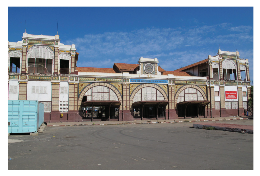
Figure 1.1 La Gare, the former terminus station of the Dakar–Niger railway in the Senegalese capital. Photo by Peter O. Jonsson, 2013.

bustling market some people were still expecting to find when turning up at the old Terminus – not the short stretch of modest retail stalls run by Fatim and her colleagues.