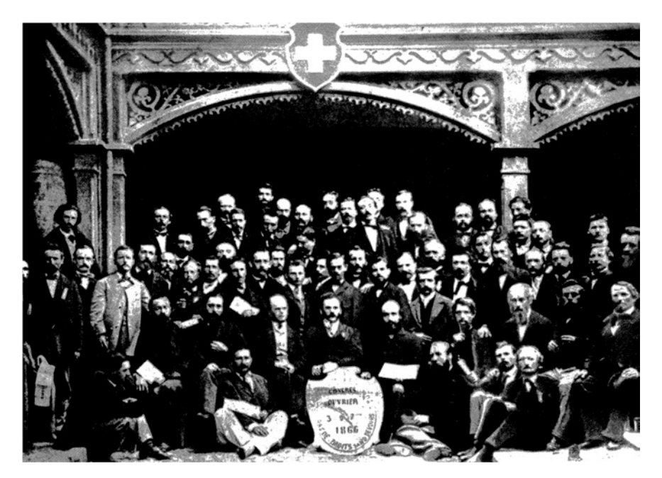
FIGURE 1.3 Delegates to the Geneva Conference 1866.