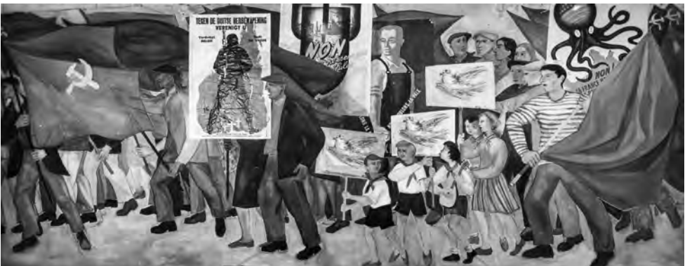
Figure 1.1., 1.2., and 1.3.

Triptych by the Belgian groups, Forces Murales and Métiers du Mur, La marche au socialisme , 1951, triptych, each 230×600 cm.