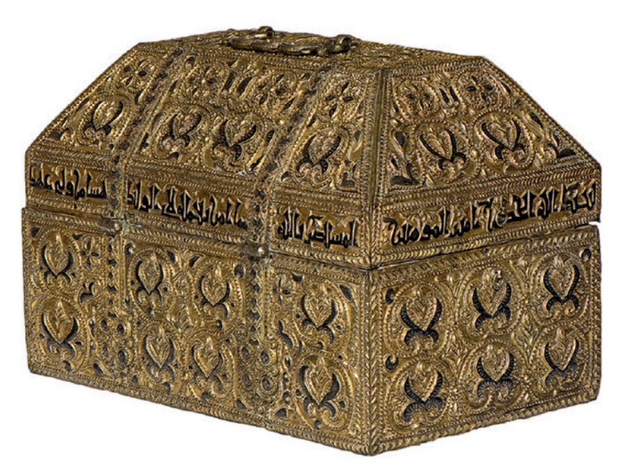
FIGURE 1 Casket made for Hishām II, c. 976, silver gilt and niello; Catedral de Girona