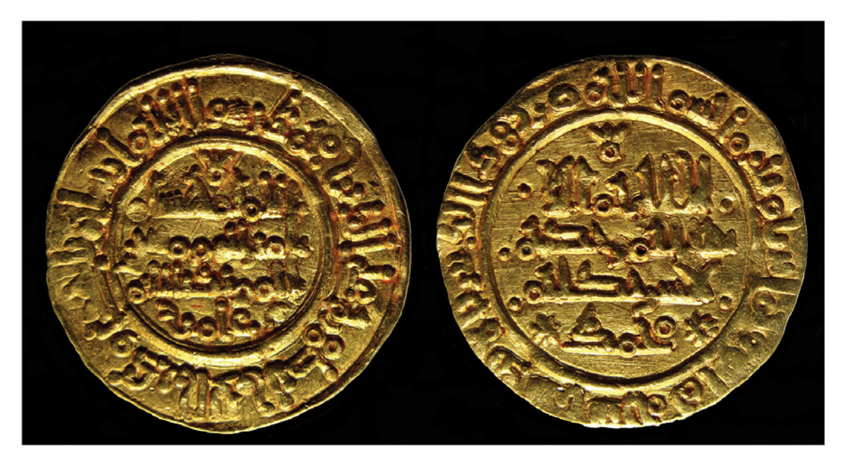
FIGURE 4 Dinar minted 388/998, Andalus mint, stamped with 'āmir; Tonegawa Collection

From the date of Ibn Abī 'Āmir's first appointment as s\bar{a}hib al-sikka, the kunya, 'āmir, designating him as the governor, appeared on every coin minted in al-Andalus until 972, when he was sent to the Maghrib (Figure 4).<sup>118</sup> Once he was reappointed s\bar{a}hib al-sikka in 363/974, 'āmir reappears on coins the same year, and occurs on the coinage every year until 996, when it significantly disappears as we will discuss below (8 'Rupture' and 9 'Restoration'). By this late date, it is not likely that al-Manṣūr's kunya on the coins still signified