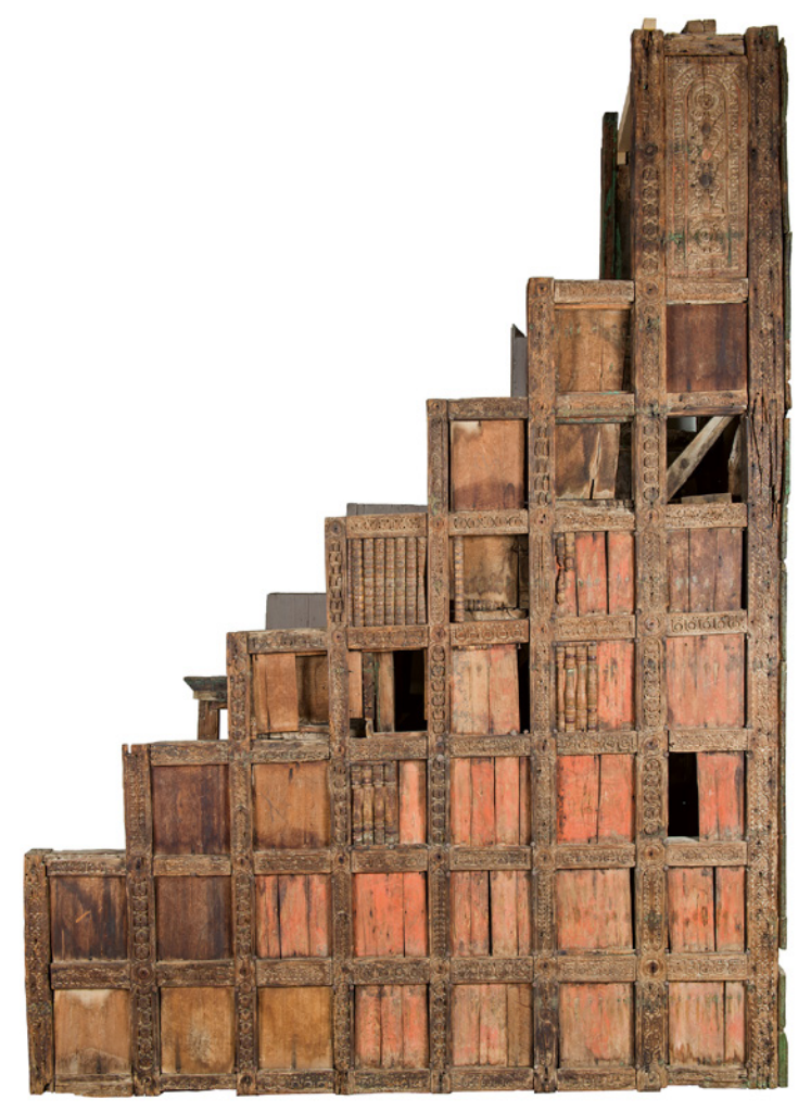
FIGURE 5 Side view of the minbar from the Andalusiyyīn Mosque, Fez, dated 980 and 985

as a trophy of war, and the rest of the minbar was burned. Buluqqīn's commission of a new minbar for Fez in 980 may also have been reprisal for the destruction of that earlier Fatimid minbar. As Maribel Fierro has noted, the prominence given in the historiography to the destruction of these Fatimid minbars is in marked contrast to that given to the creation of a new minbar for the Great Mosque of Cordoba,<sup>224</sup> commissioned in the 960s by al-Ḥakam II, and described in great detail by all the sources on this period. These circumstances and parallels all point to the potency of minbars as