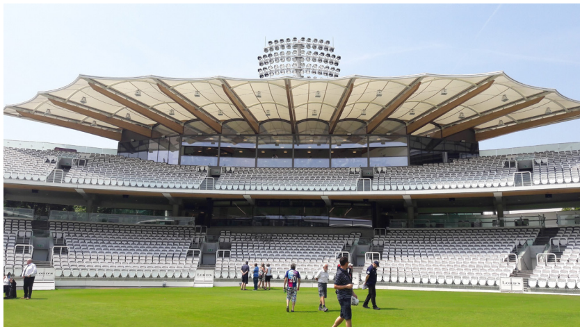
Figure 5.1: The New Warner Stand at Lord's Cricket Ground (Photo: Andrew Smith).

4.2 billion (Eurosport 2015). Consequently, many domestic and international tourists want to attend a live match or visit the stadium of EPL teams when they come to London.