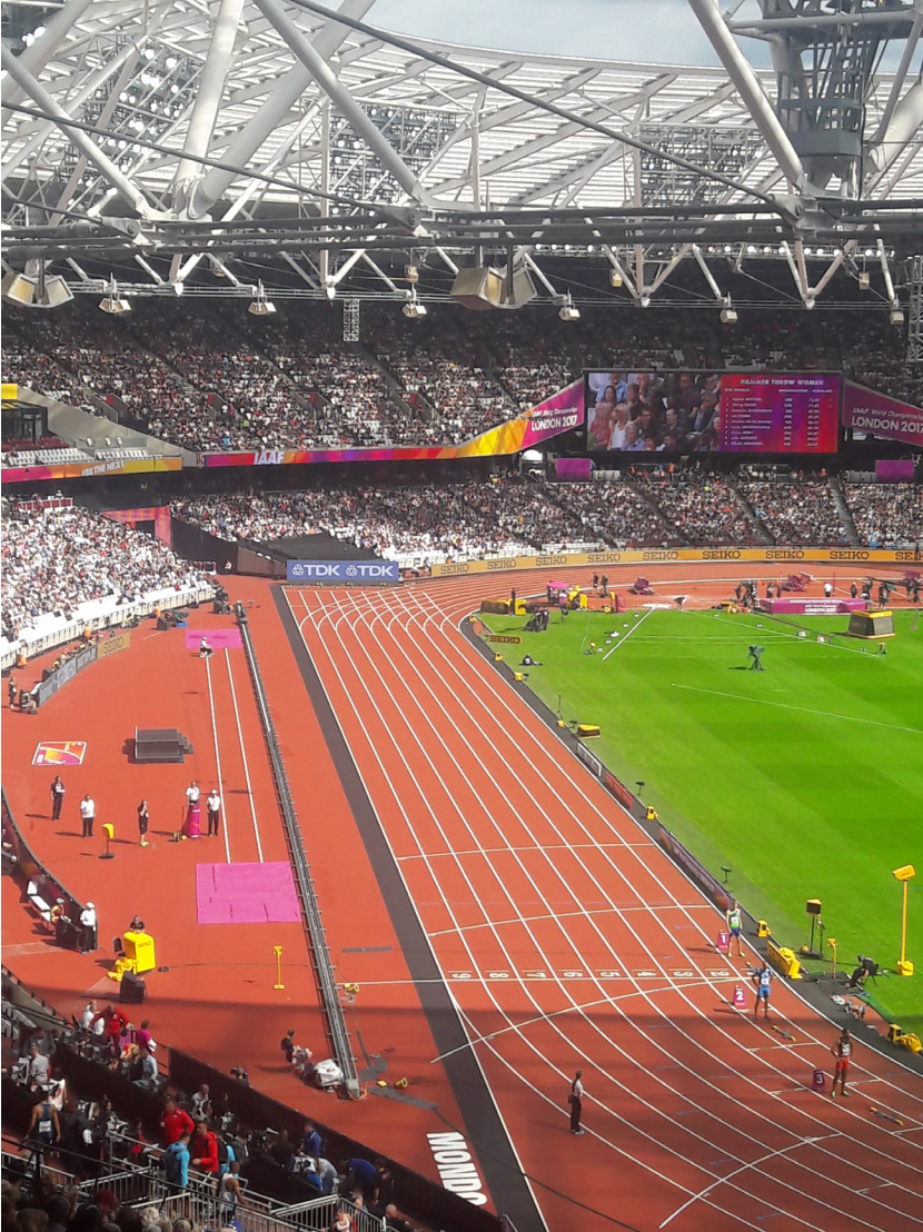
Figure 5.5: The London Stadium in Athletics Mode.

While the Olympic Park hosts tours of the Aquatics Centre, Velodrome and London Stadium, it is the last of these that attracts the greatest demand. From the reviews it is clear that its Olympic history is still an important part of its appeal. Many Olympic cities mark anniversaries of the Games (Cashman 1999) and London is no exception, with the stadium hosting an athletics meeting every July. Consequently, annual TV coverage displaying the