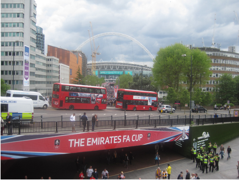
Figure 5.3: Wembley Stadium on FA Cup Final Weekend.

The lack of a home ground has not put paid to Tottenham Hotspur stadium tours, with specialist ‘Spurs at Wembley’ tours offered on the days adjacent to their home matches. Furthermore, the importance of serving the visitor market is revealed as the club has already announced that tours will be available at the new stadium when completed. The new stadium has been designed to incorporate a permanent visitor centre, housing a museum and Hall of Fame.