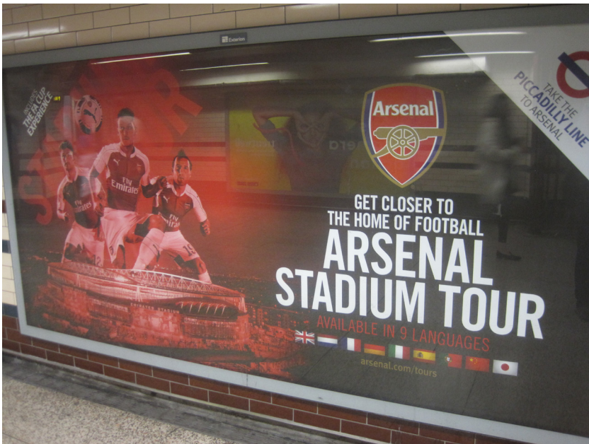
Figure 5.2: Poster on the London Underground Advertising Tours of Arsenal Football Club (Photo: Andrew Smith).