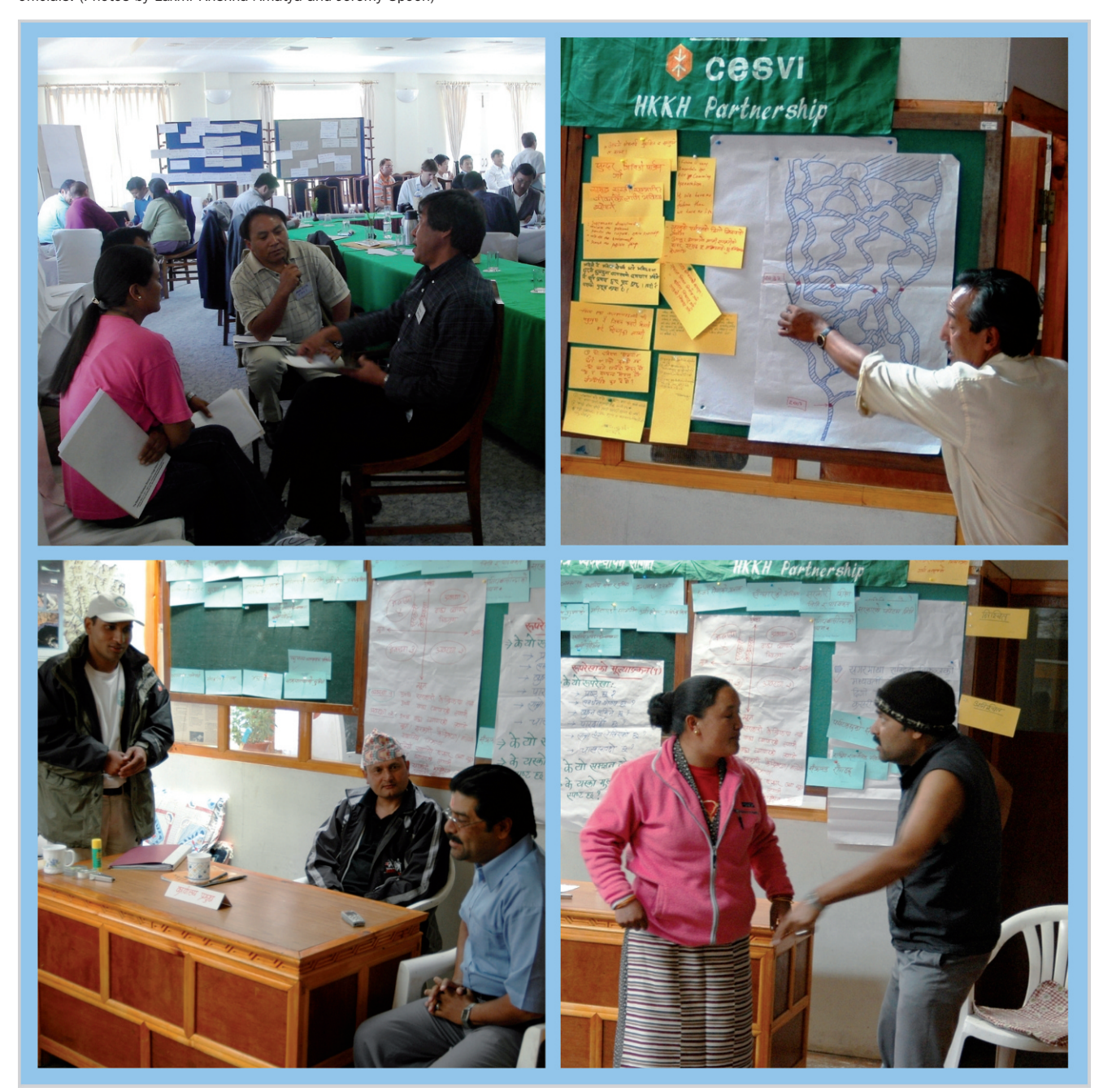
FIGURE 3 Clockwise from top left: (1) Scenario group work with tourism industry and NGO experts during the first workshop; (2) we presented the growing uncertainty of future park states and trajectories as sequential points along a braided river channel; (3) during our second scenario workshop, an actor plays a rogue community member as a metaphor for loss of local social norms; (4) in another dramatized scenario, an outside businessman tries to influence local park officials.

strongly supported park management devolution and local self-governance. However, discussion of the "autonomous Khumbu" scenario surprisingly revealed that participants did not have full confidence in local