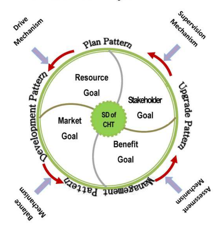
FIGURE 1 - THE INNER STRUCTURE OF SUSTAINABLE DEVELOPMENT OF CHT

In these related literature, it is apparent that at present the research concerned has involved many fields, including local people, resource protection, tourism management, benefit sharing, tourism planning, cultural inheritance, talent training, tourism marketing and other similar elements. Given the general rules of STD, the inner structure of STD in CHT basically consists of four dimensions, four goals, four patterns and four mechanisms as shown in Figure 1.